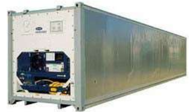
40FT Reefer Container