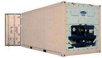
20FT Reefer Container