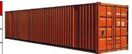
40FT Dry Container