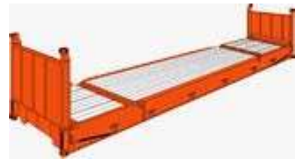
20FT Flat Rack Container