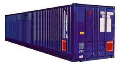
40FT High Cube Container