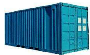
20FT Dry Container