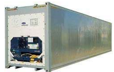
40FT High Cube Reefer